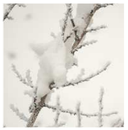
"Your season of change has come"